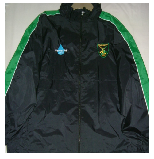
Jacket with sponsors logo