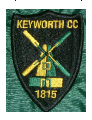
Badge from 2007 onwards