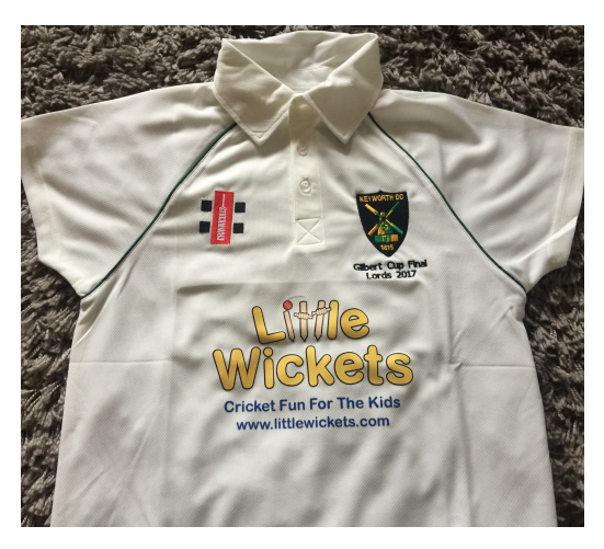
Girls U11s 'Lords' Shirt