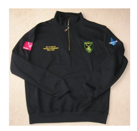
Double Winners Top