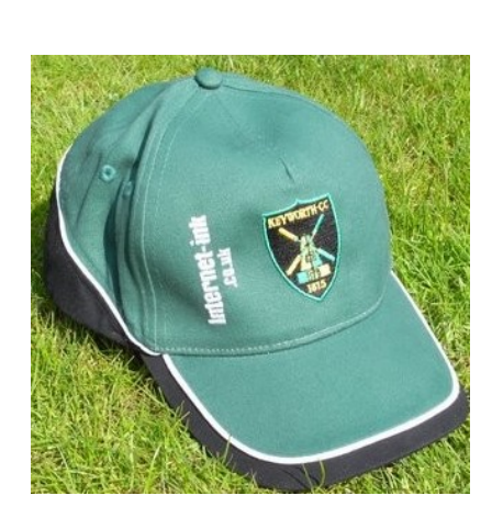
Cap with sponsors logo