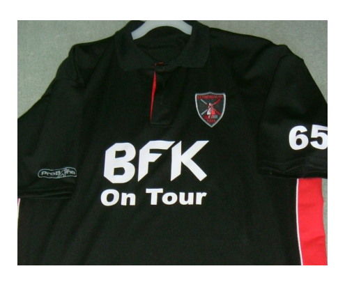
Suffolk Tour Shirt (BFK = Bat First Keyworth)