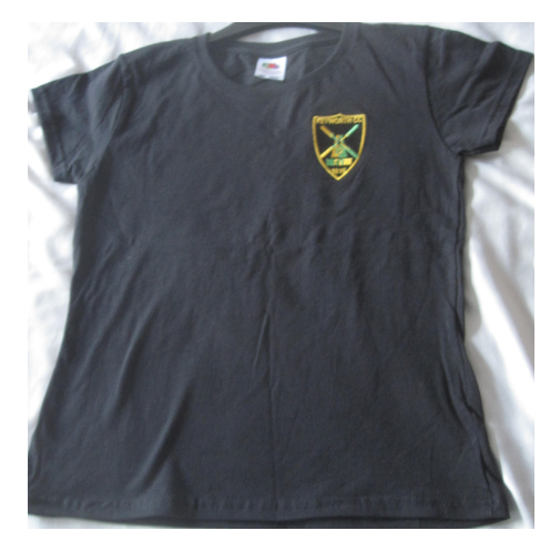
Girls Team Training Shirt