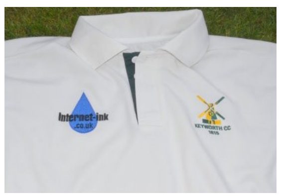
Playing Shirt with Sponsors Logo