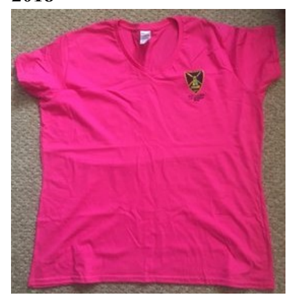
Ladies Softball Shirt