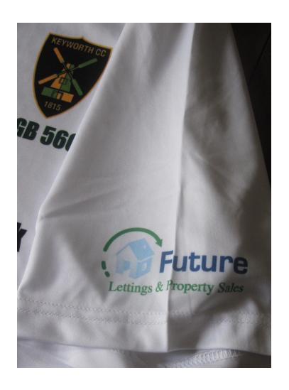
Sponsored Shirt with sponsored sleeves & Commemorative Stumps