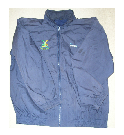
Tracksuit Top (front)