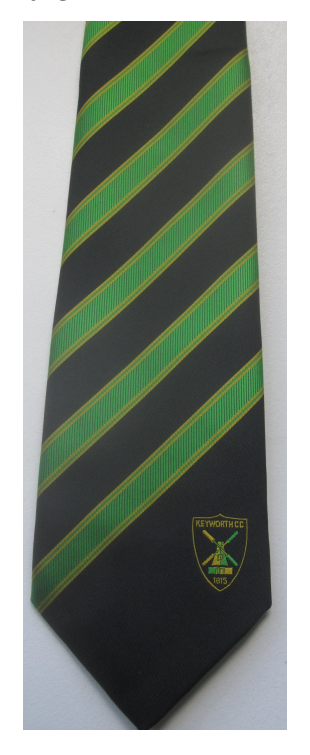
First KCC Club Tie