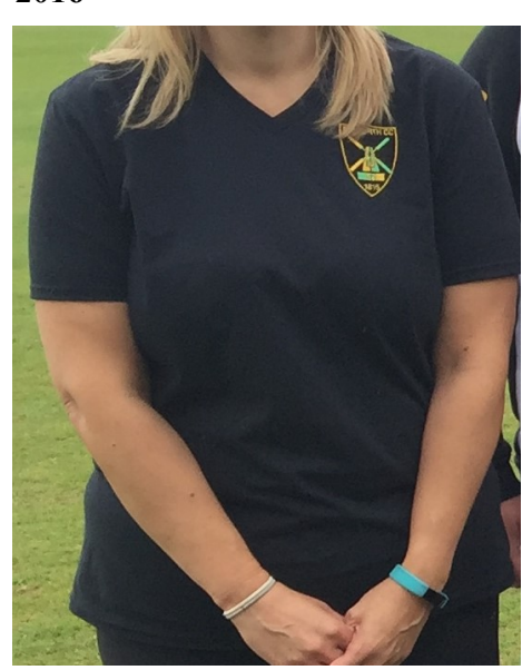
Ladies Team Shirt