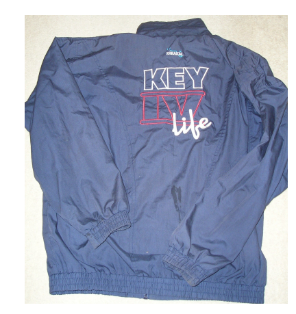
Tracksuit Top (back)